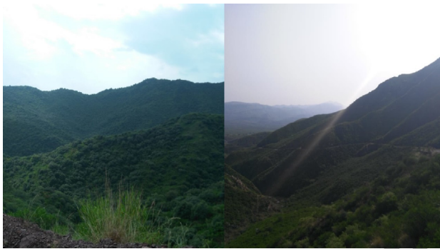
Fig. 3. Habitat potential of Nowshera District.

The successful ex-situ conservation shows that the climate and habitat (Fig. 3) in Nowshera district are very suitable for the wild ungulates. Chinkara, now found in semi-wild habitats of Nizampur area, was reintroduced by the wildlife department KP. Likewise, Urial are also flourishing in ex-situ conservation with the aim of reintroduction under the auspices of wildlife department KP (Khattak et al. , 2019b, 2020). The presences of both these species was once confirmed in Noswhera District by Malik (1987). Three species of bats reported in the current inventory were also confirmed by (Rahman et al. , 2015).